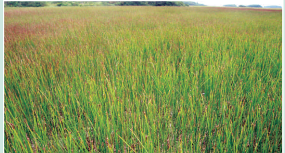
Dense stand of Olney's Bulrush

Similar species: Three-square Bulrush ( Schoenoplectus pungens ) has a triangular stem that is not concave and does not have pronounced ridges. Hard-stemmed Bulrush ( Schoenoplectus acutus ) and Soft-stemmed Bulrush ( Schoenoplectus tabernaemontani ) can occur in brackish wetlands but are taller with round stems. Other similar bulrushes do not occur in salty or brackish habitats.